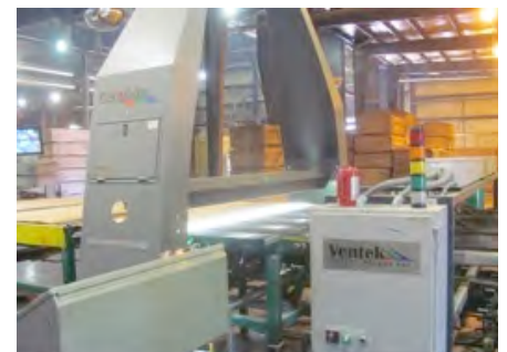
One of two automated graders at work, scanning each sheet of veneer as it passes.

into a final plywood sheet, and then the edge and end cutting of these sheets just before the final visual inspection of both sides of each sheet. We were told that the mill produces about 100,000 4' x 8' panels of plywood each week, much of which is shipped to the East Coast and sold to Home Depot.