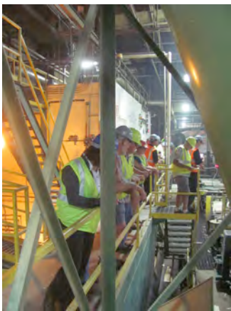
Observing the layering and lamination process for each sheet of plywood.

The tour began with a briefing by the Boise Cascade staff on safety, as well as the current lack of local timber supply, and how far they now have to go to get enough logs to keep the mill running at 100% of capacity. People broke up into three groups that then walked through the mill where they observed a number of different stages in the plywood